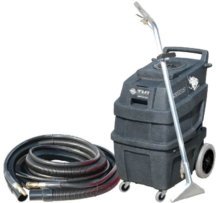
standard color: charcoal granite