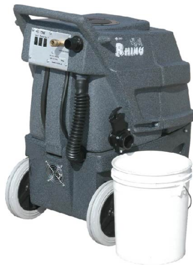
picture shown with optional drain valve

NOTE: * some options may not be used with standard specifications. * hose length can be added 5 ft. increments up to 50 ft. per length.