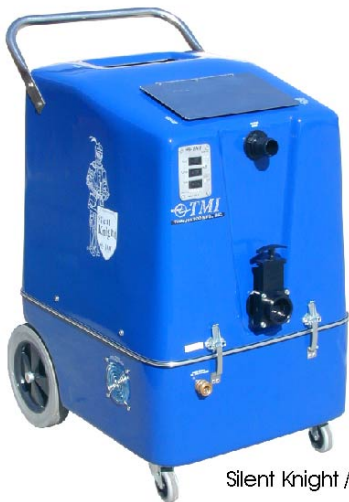
Silent Knight / Super Quiet Version