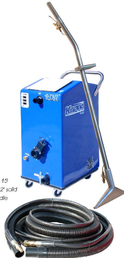
picture shown with 15' vacuum hose & 15' solution hose and 12" wand with grip handle

CAUTION: Do not use flammable and volatile material.