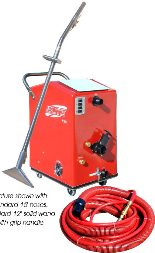
picture shown with standard 15' hoses, standard 12" solid wand with grip handle

Manufacturer of commercial & environmental cleaning equipment