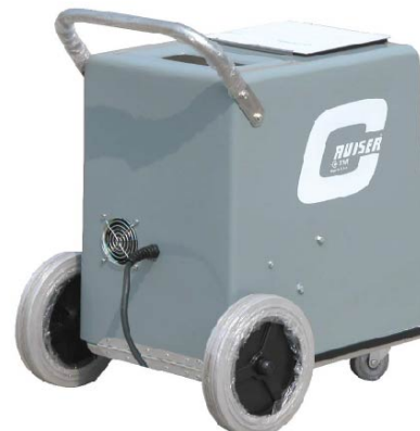
picture shown with optional acoustic muffling system in grey color

NOTE: * some options may not be used with standard specifications. * hose length can be added 5 ft. increments up to 50 ft. per length.