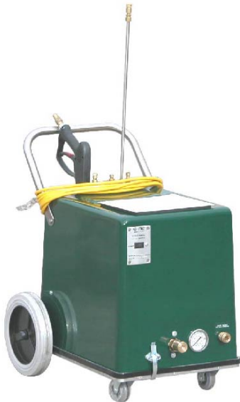
picture shown 12 gallon green with optional equipment