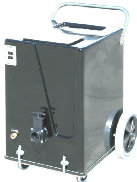
picture shown 40 gallon black

CAUTION: Do not use flammable and volatile material.