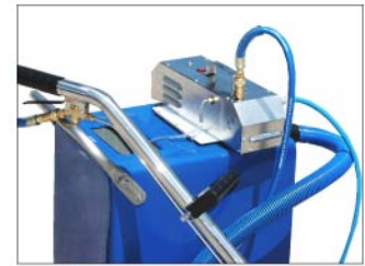
picture shown with optional electric instant water heater with stainless steel wand