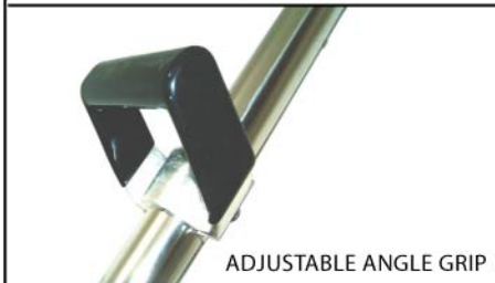
ADJUSTABLE ANGLE GRIP