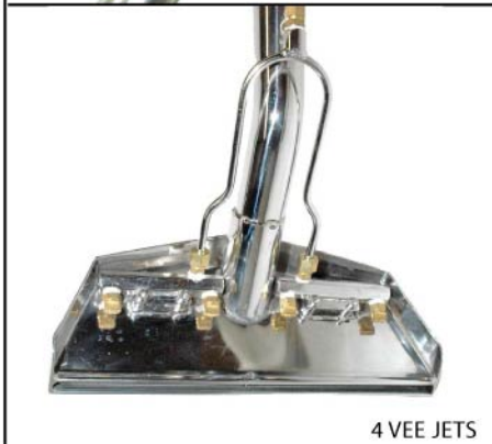
4 VEE JETS

Optional Items: other type of quick connector, other type of spray jet, extra length of stainless steel tube are available.