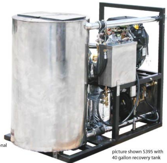
picture shown S395 with 40 gallon recovery tank

CAUTION: Do not use flammable and volatile material.