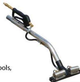
picture shown optional counter top/wall 3000psi SQ wand