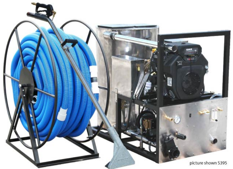
picture shown with optional storage reel and standard 100' hose