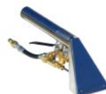
picture shown optional H.S. stainless steel by-pass hand tool