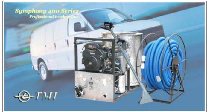
picture shown S-458 truckmount with vacuum hose storage reel with 200' vacuum hose, 12" Auto-Seal wand, and 3000 psi valve, 2 jets with grip