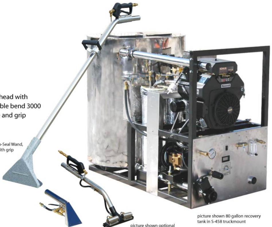
picture shown optional H.S. stainless steel by-pass hand tool