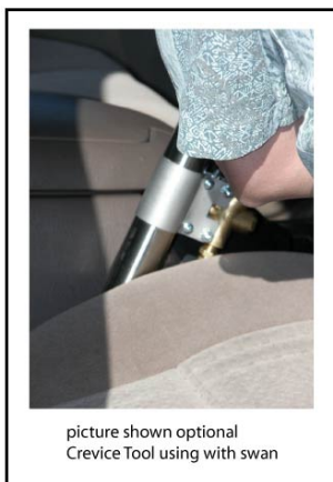
picture shown optional Crevice Tool using with swan