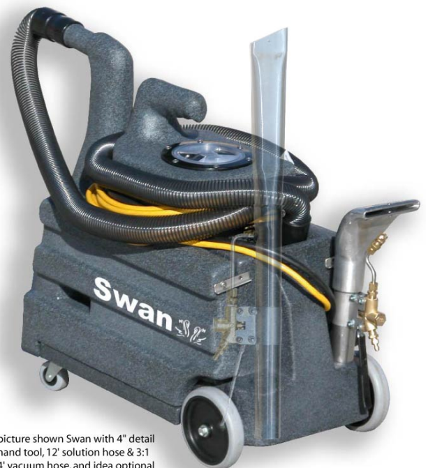
picture shown Swan with 4" detail hand tool, 12' solution hose & 3:1 4' vacuum hose, and idea optional Crevice Tools