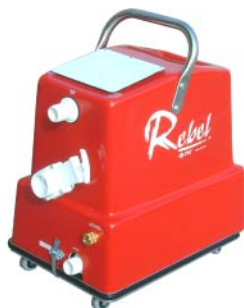
picture shown with optional stationary handle.