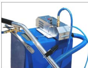
picture shown with optional electric instant water heater with stainless steel wand