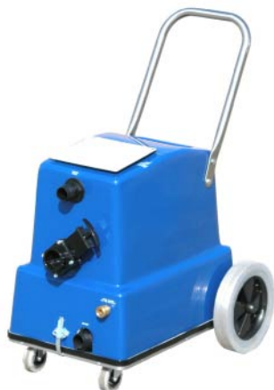
picture shown with optional long stationary handle.