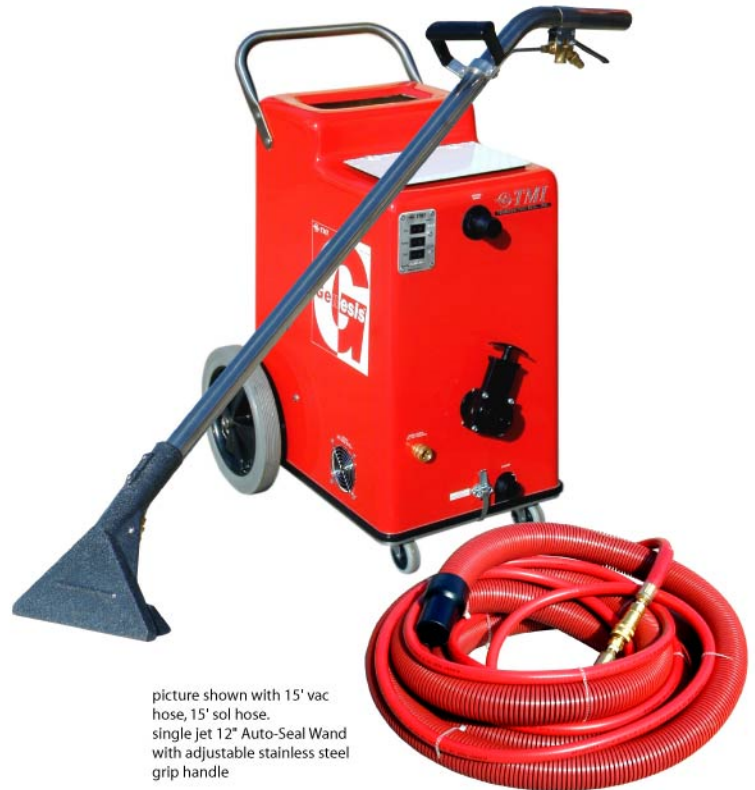
picture shown with 15' vac hose, 15' sol hose, single jet 12" Auto-Seal Wand with adjustable stainless steel grip handle