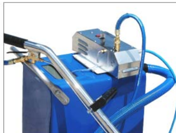
picture shown optional electric instant water heater with stainless steel wand