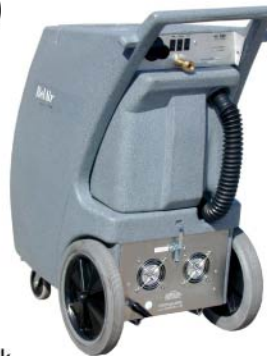
rear view of BelAir, easy access switches, handle, drain hose, all the mechanical parts