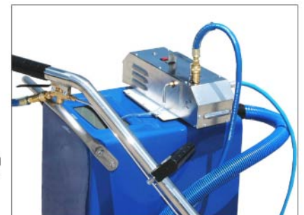
picture shown with optional electric instant water heater with stainless steel wand