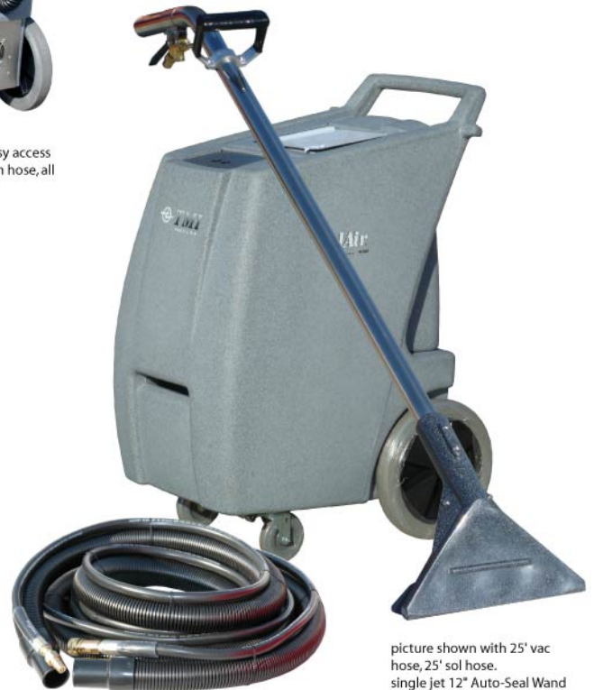
picture shown with 25' vac hose, 25' sol hose. single jet 12" Auto-Seal Wand with adjustable stainless steel grip handle