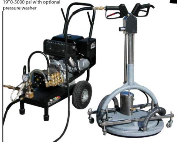
picture shown Hydor-Blade 19" 0-5000 psi with optional pressure washer

New Technology for Hard Surface cleaning